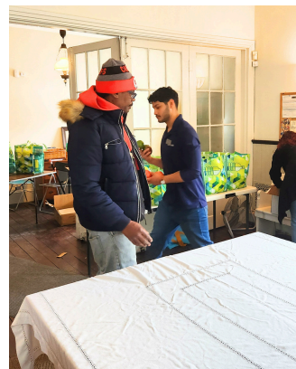
Winding down after 100 plus bags distributed

It can't be forgotten that on Tuesdays, Arm In Arm distributes food bags to individuals and families in our neighborhood and beyond. The bags include meat, fresh produce and non perishables.