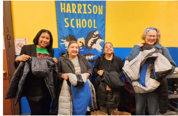
Winter wear being delivered