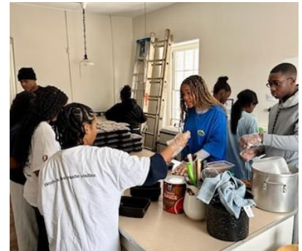
The kitchen was very busy!