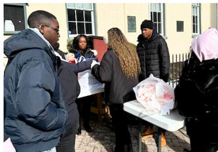
Getting meals and coats