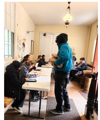
Volunteers and staff welcoming the community