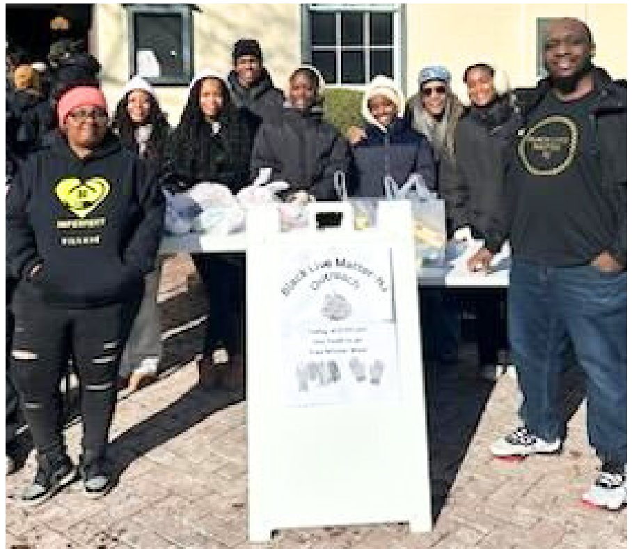
Here's most of the crew