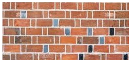
Example of Flemish Bond brickwork