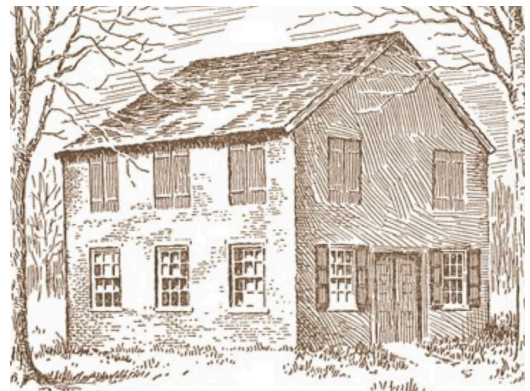
Trenton Friends Meeting House